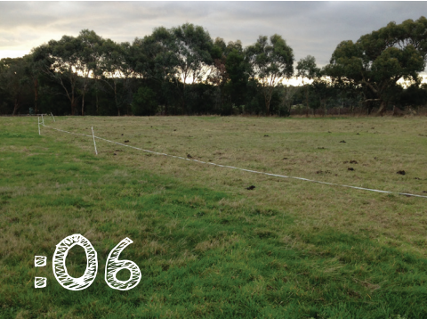
Table 1 shows how set stocking rates are dramatically affected by the condition of the pastures and also the types of animals being run. Cattle and horses require significantly more land than sheep to maintain them year round without supplementary feed.

Case study example: John & Julie purchased a 10ha (24.7 acre) property and want to grow and finish store steers. Their pastures are old improved but degraded pastures on average to good soils but have had no fertiliser inputs for the past 15 years. They have been told with improved soil nutrition and grazing management they could comfortably increase their carrying capacity 50%.