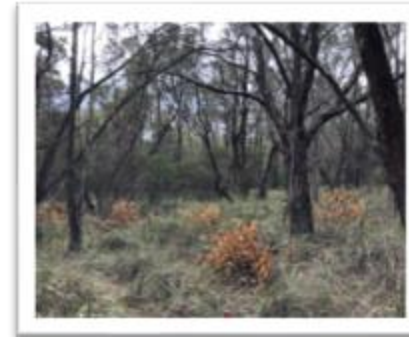
Above: Before and after photos of Sweet Pittosporum control at The Gurdies Conservation Reserve (1 of our 12 sites)